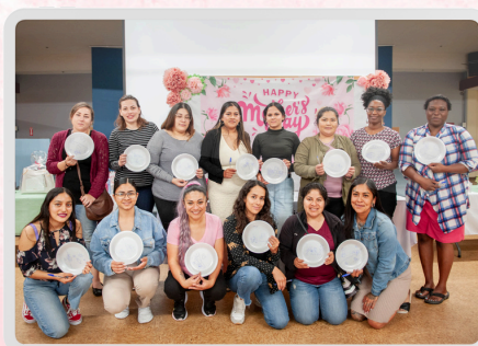
Moms who took part in a variety of fun games had plenty of giggles plus a chance to earn generous prizes.