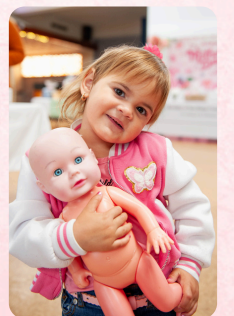
One of our young guests strikes a charming pose.