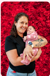
A new mom and her baby by the floral photo wall.