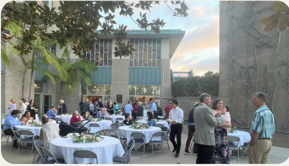
Guests mingle during sunset at Our Mother of Confidence's intimate St. Paul Patio.