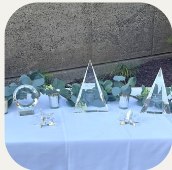
Engraved awards were presented to our top supporters.