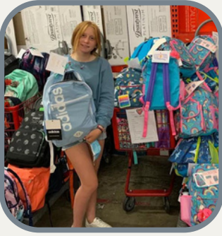
Kalia partnered with Staples to collect backpacks & supplies.