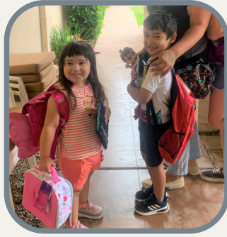
Smiling preschoolers with new backpacks and lunchboxes.