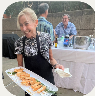
Delicious catering was provided by The French Gourmet.