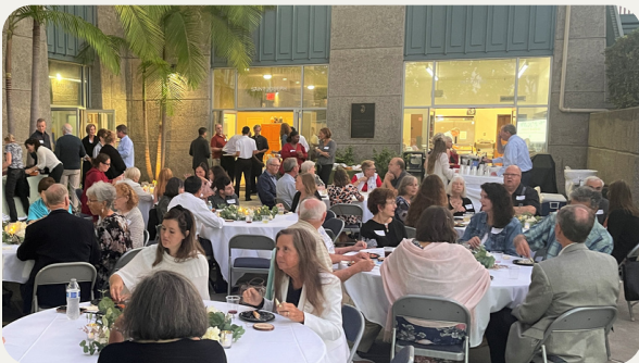
Volunteers, staff and guests enjoyed each other's company and the outdoor setting.