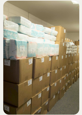
Birthline's diaper storage room.