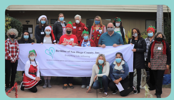
Board, volunteers and staff at our Holiday Event.