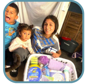
Our July basket (left) had a “Fun in the Sun” theme. Above, our August winner with the “Squeaky Clean” basket.